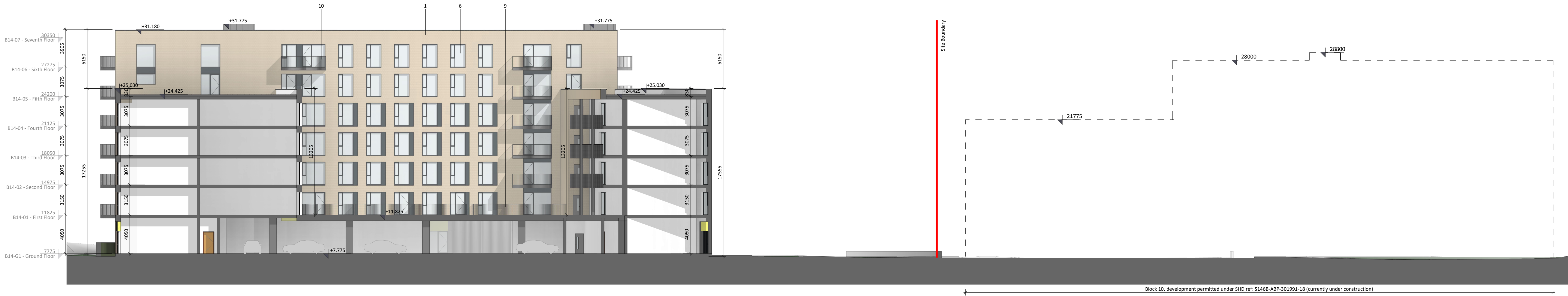
1 B14 Section A-A 1:200